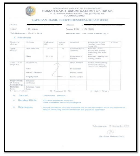
Figure 1 < Display of Reports on the Results of Brain Wave Recording (EEG)>

Through these results it is expected that the counselor will be able to diagnose empirically the problems being experienced by the counselor. The use of EEG at the beginning of the counseling process can be a strong and empirical assessment as the first step for the counselor to follow up on the working stage.